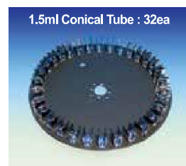
(3) Disk, “WRT120”