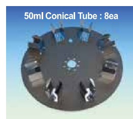
(1) Disk, “WRT100”