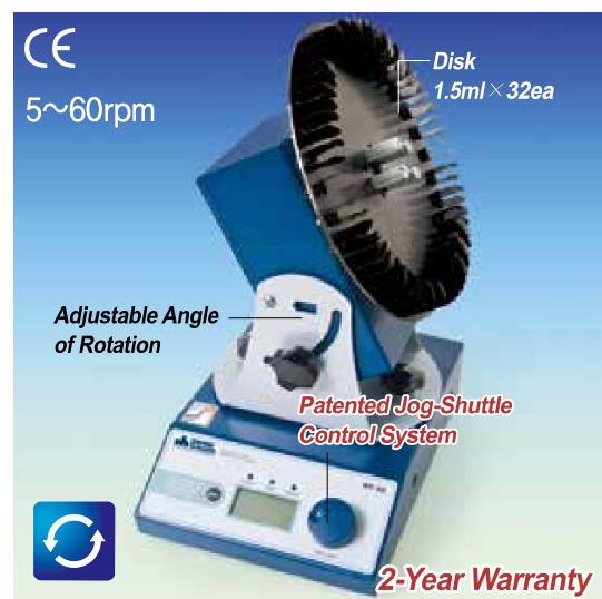
Programmable Digital Rotator “RT-10” with 1.5ml × 32ea Disk (WRT120)

디지털 로테이터, 디지털 피드백 컨트롤 시스템, 회전각 및 회전속도 조절 가능