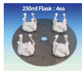
(5) Disk, “WRT140”