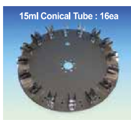
(2) Disk, “WRT110”