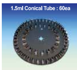
(4) Disk, “WRT130”